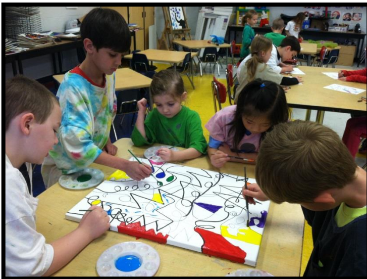
1 st Grade working on their art piece for the auction