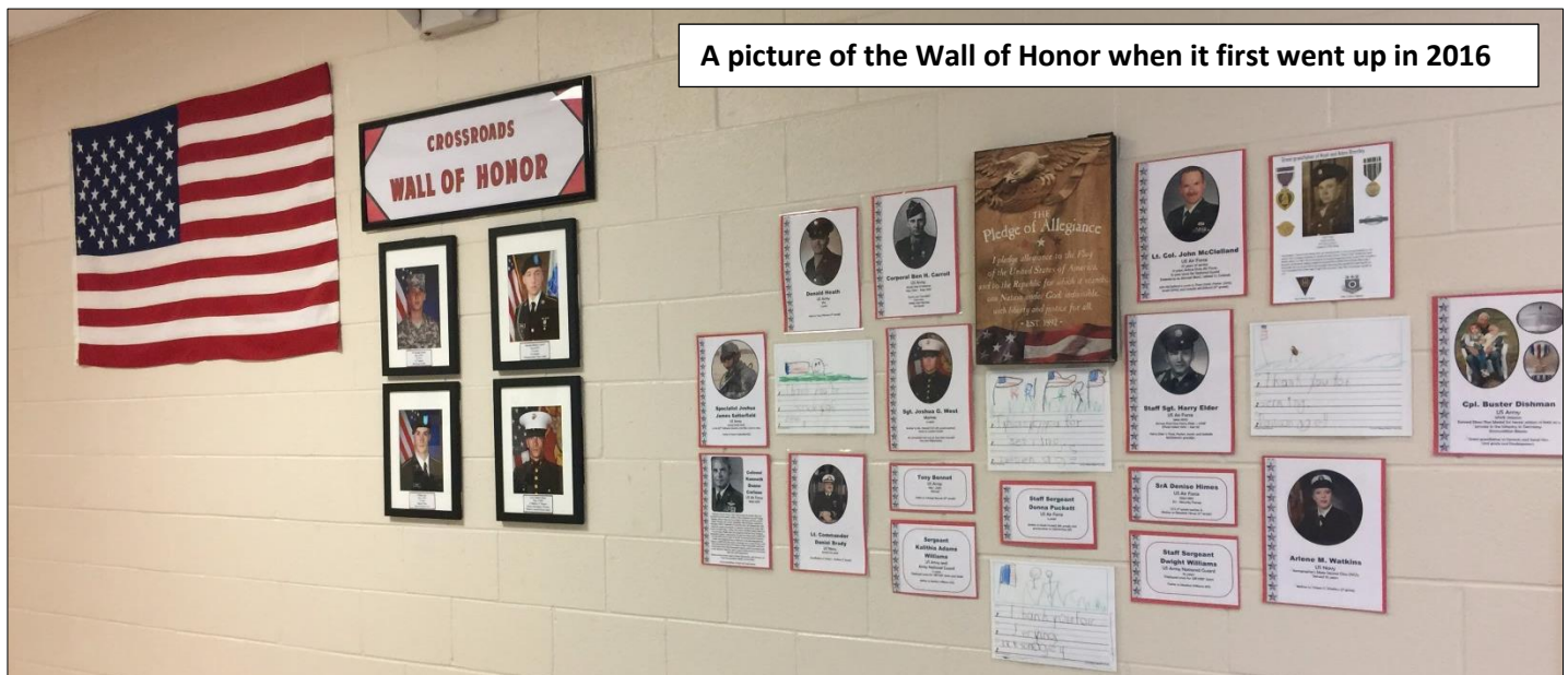
A picture of the Wall of Honor when it first went up in 2016

During the summer, our Wall of Honor was taken down so the school walls could be painted. The Wall of Honor is a display honoring Crossroads' alumni who have served or are serving in the military, as well as those in any of our CCS families. It was first put together in 2016 and has grown through the years as families added to it. The National Honor Society will be putting up the wall again before Veterans' Day, and they are asking for additions from our school family. An email will be going out about this to all families with specific guidelines for pictures and information needed.