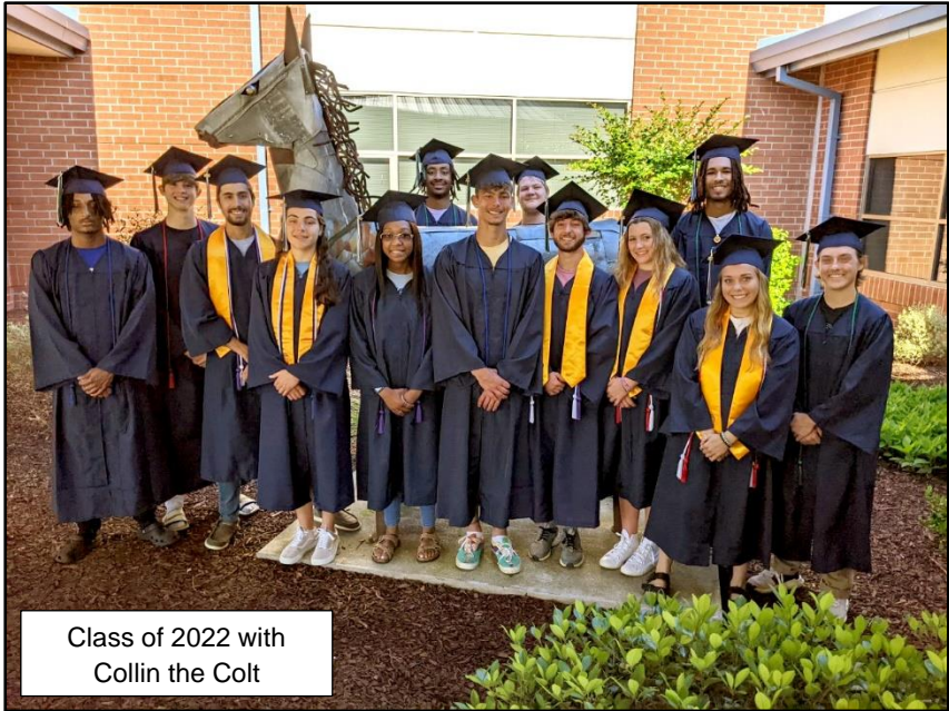
Class of 2022 with Collin the Colt