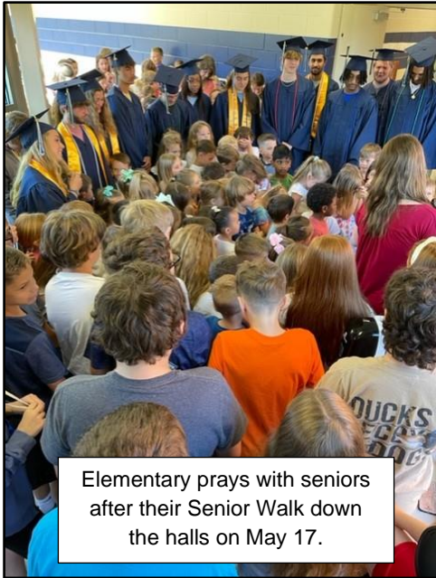
Elementary prays with seniors after their Senior Walk down the halls on May 17.