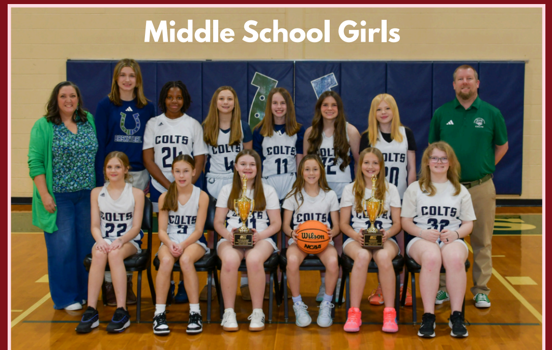
Middle School Girls