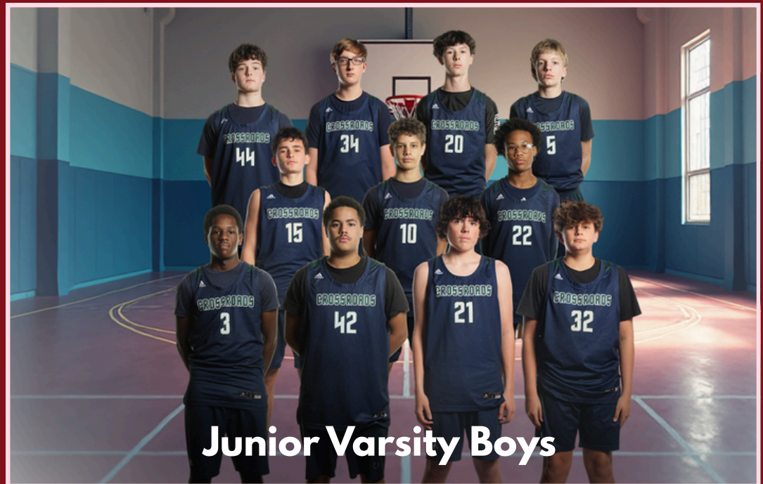
Junior Varsity Boys