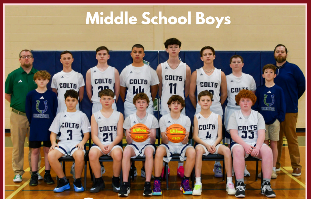
Middle School Boys